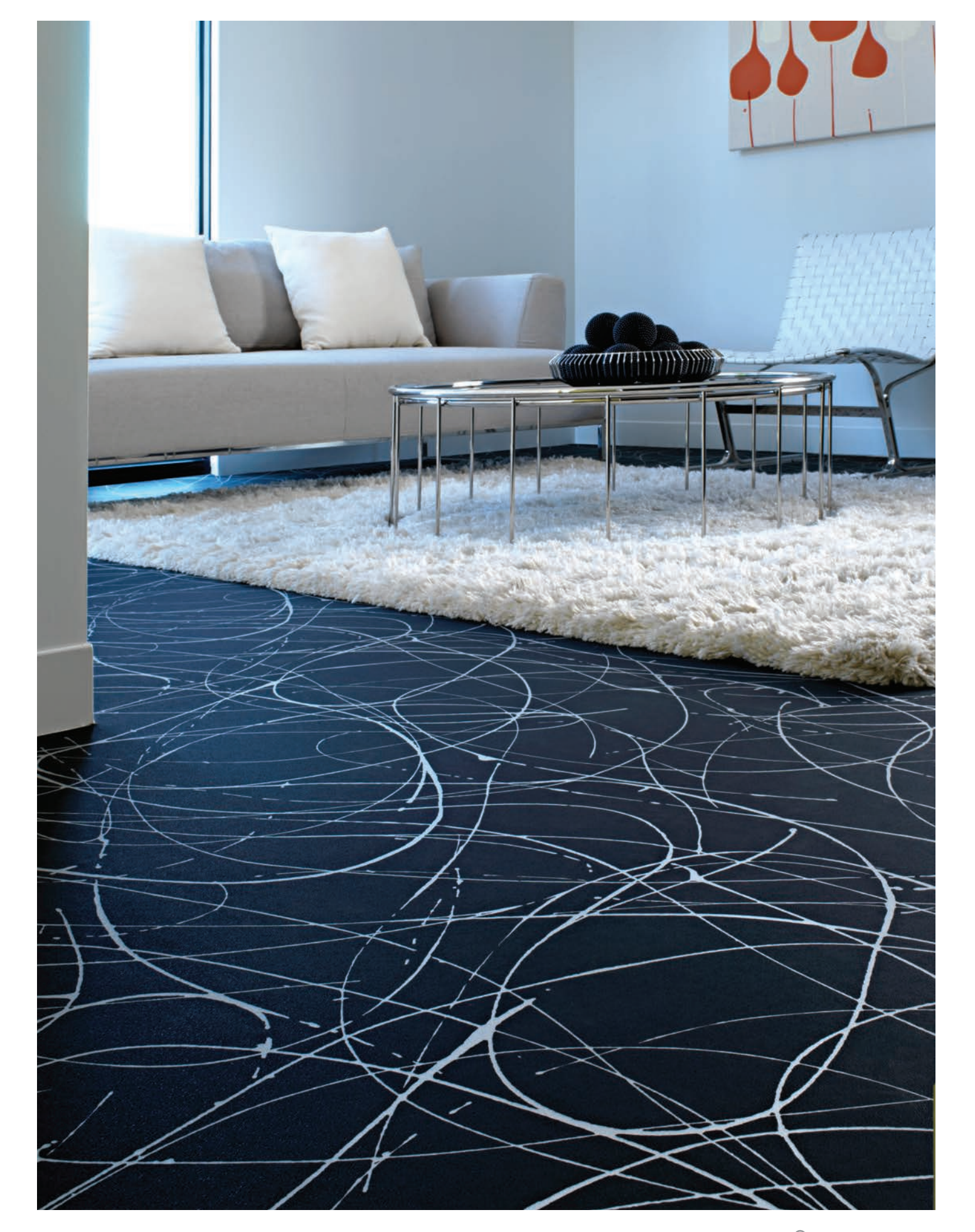
featuring: Signature Floors artesia design