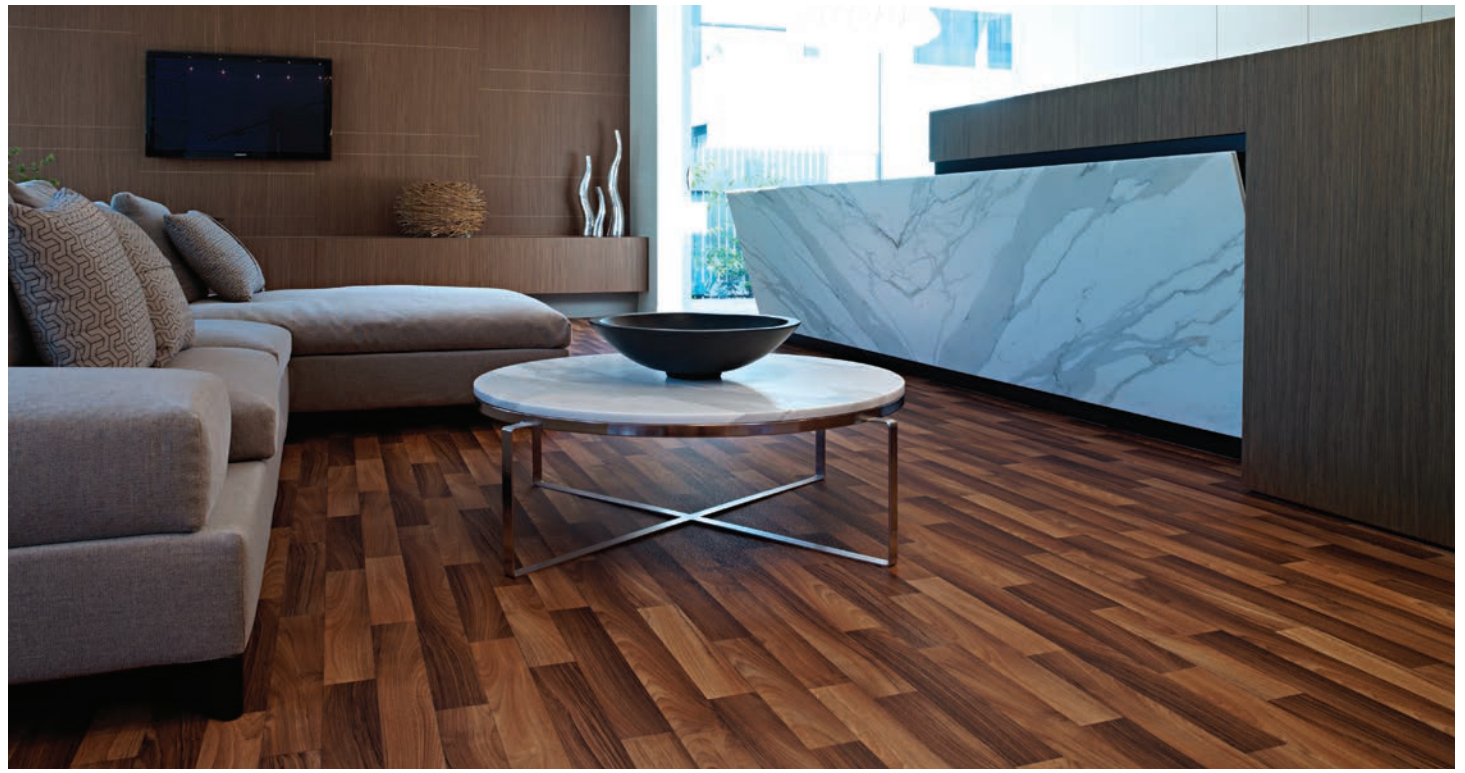
featuring: Signature Floors walnut design

After checking that the seam sealer on the joins has dried, wash the floor using the Signature Floorcoverings Cushion Floor Cleaner – follow the instructions as listed on the back of the bottle.