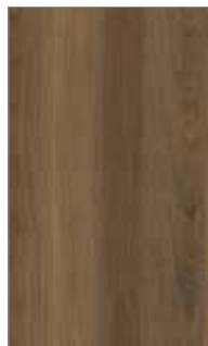
555 COLONIAL SPOTTED GUM