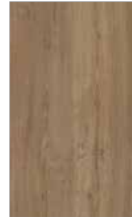
520 PARK LANE