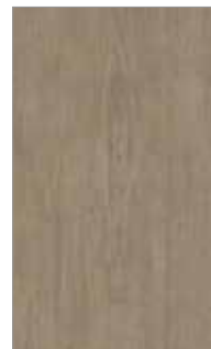
560 HIGH STREET