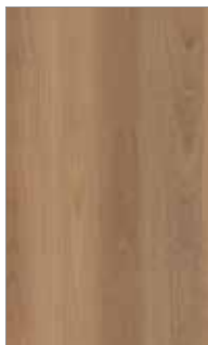
545 COLONIAL BLACKBUTT