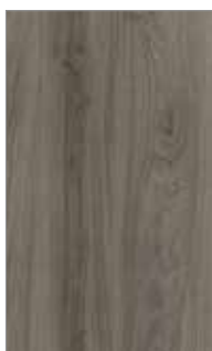
730 NOTTING HILL