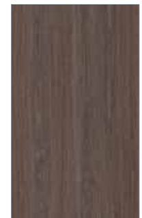
640 FLEET STREET