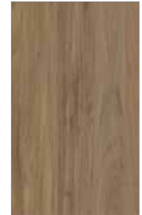
530 ST JAMES