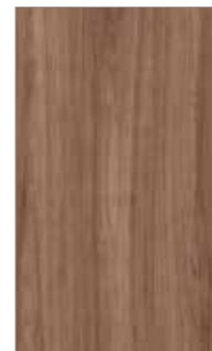
625 MARBLE ARCH